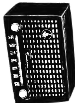
MODEL 653 Chassis 120080B