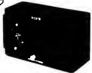
VIEWED FROM BOTTOM OF CHASSIS